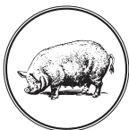
SMOKED HONEY GLAZED HAM (13-16lbs)