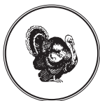
WHOLE SMOKED TURKEY (12-15lbs)