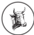
SMOKED PRIME RIB (8-10lbs)